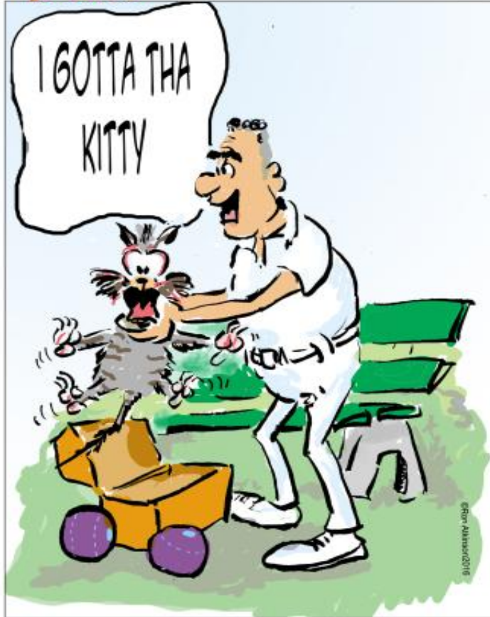
SPIRO WAS A LITTLE CONFUSED